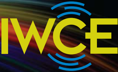
Exhibit Hall Guest Pass

Converge. Collaborate. Communicate. iwceexpo.com